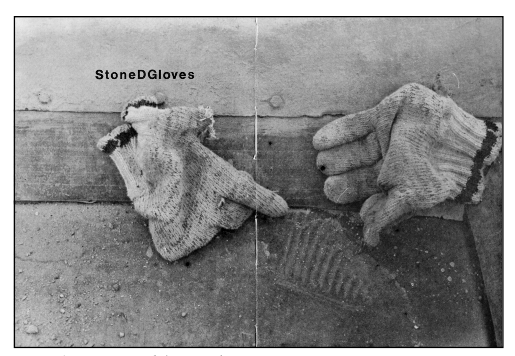
Figure 1: from Roy K. Kiyooka's StoneDGloves

The text that Kiyooka eventually produced with these photos was not, in fact, displayed at Expo '70, contrary to what critics such as Stephen Morton have recently and erroneously claimed (see Morton 107n3). These photos eventually became part of StoneDGloves (see Figure 1), a text that, in Roy Miki's account, "doubl[ed] as a catalogue for [Kiyooka's] first major photo exhibit which opened at the National Gallery of Canada in 1970" ("Afterword" 309), touring across Canada and then exhibited in France and Japan.<sup>5</sup>